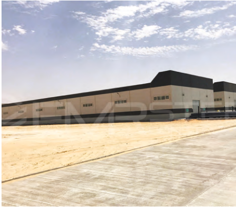
AFRIPLAST INDUSTRIAL ZONE MORITANIA