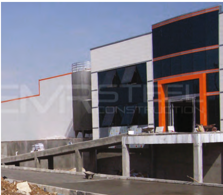
MILK INDUSTRIAL FACILITY