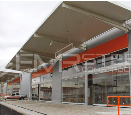
AUTO GALLERY – SHOWROOM