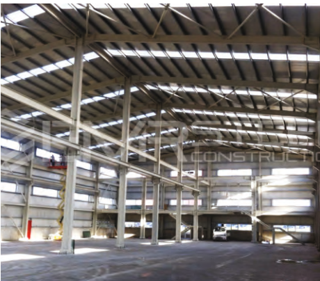
FOOD INDUSTRY HEADQUARTER