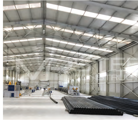
AFRIPLAST INDUSTRIAL ZONE MORITANIA