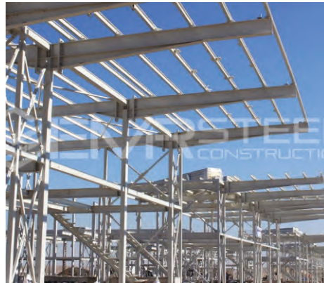
AUTO GALLERY – SHOWROOM