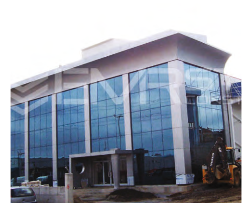
FOOD INDUSTRY HEADQUARTER