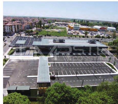
TERMINAL BUS STATION