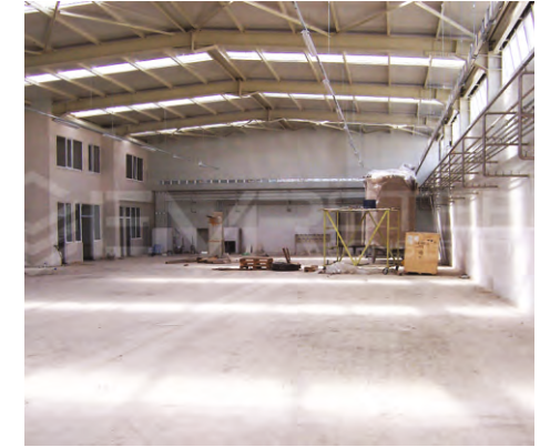
MILK INDUSTRIAL FACILITY