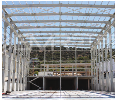
STRUCTURAL STEEL MARINE