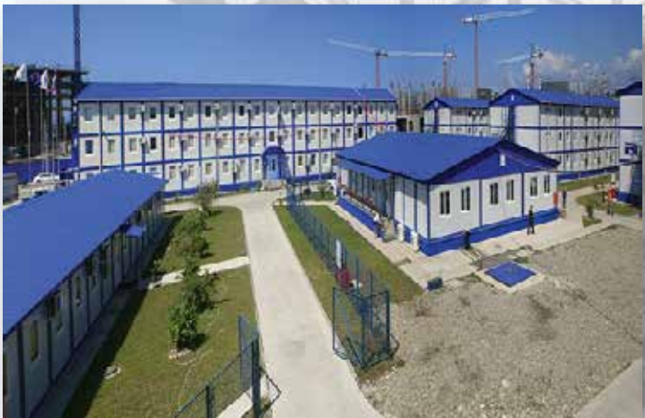
EDUCATIONAL BUILDING AGRICULTURE