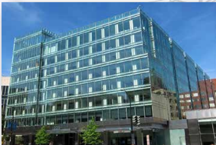
HEALTHCARE B BUILDINGS HANGARS